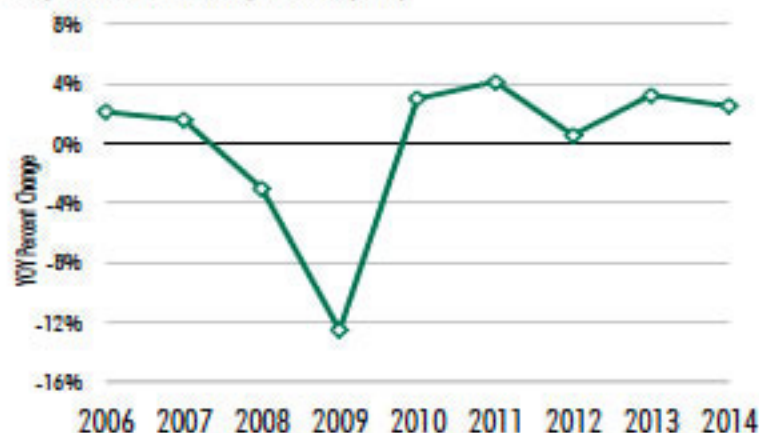
Long Term Annual Change in Occupancy