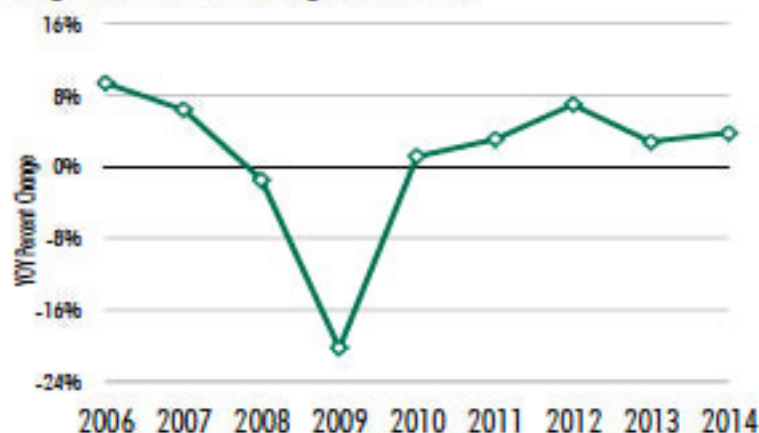
Long Term Annual Change in RevPAR